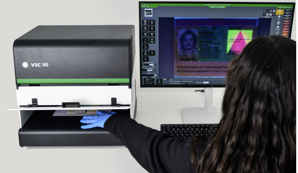
Image annotation and calibrated measurements provide precise documentation, while the advanced comparison and enhancement toolset including 3D imaging, Focus Stacking and Focal Plane Merging, reveals hidden details.