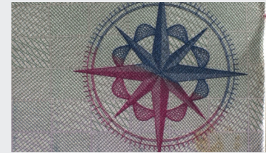
Fine Print Detail