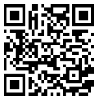
X600 Pro 3D demo