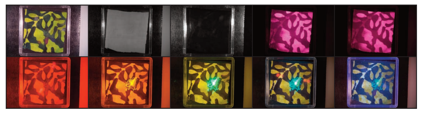
Validation images are captured under a selection of illumination/filtration conditions