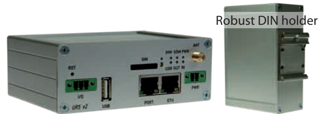
Version SL - metal housing