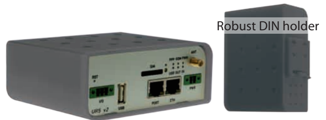
Version in plastic housing