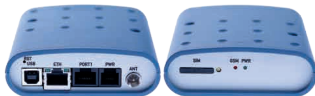
Standard version in plastic cover