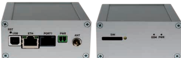
Version SL - metal cover